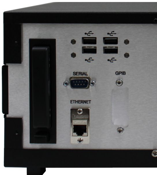
Rear panel removable drive and input/output connectivity