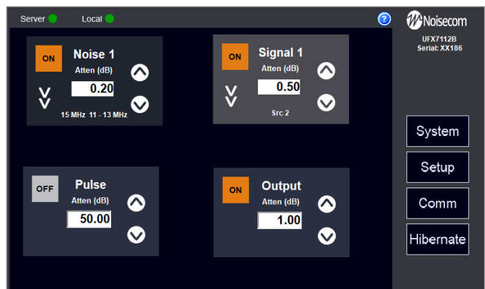
Intuitive standard control menu