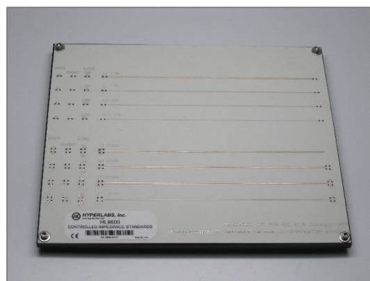
Figure 1: HL9600 Calibration Standards Substrate