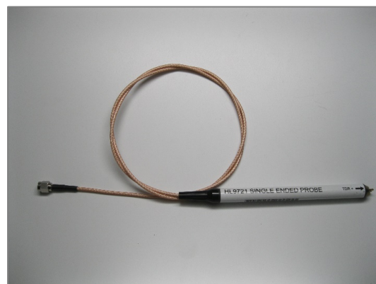
Figure 1: HL9721 Single-ended Pencil Probe